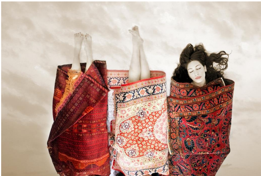
© Babak Kazemi, Exit of Shirin & Farhad , 2012. Courtesy de la galerie Silk Road et de l'artiste.

With "The Exit of Shirin and Farhad", Babak Kazemi offers a modern writing of one of the greatest classical texts of Persian culture, "Shirin and Farhad" by the poet Nezami Ganjavi (1175). Revisiting this patrimonial love story through photography is a roundabout way for the artist to evoke the current struggles of those who have to go into exile to find love and freedom.