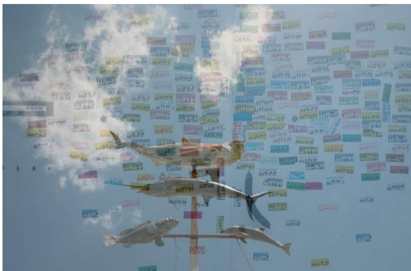
© Morvarid K, The Thin Line , 2016. Courtesy of the artist.

Morvarid K's "The Thin Line" explores the boundaries that separate two worlds, two cultures, two imaginaries. The overlay of two photographs, one taken in Iran, the other somewhere else, brings about a third reality, that of men and women who, like the artist herself, are inhabited by different cultures. These images of a great poetry bring out the invisible, the absence, this missing part that goes through all identity quest.